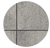
Industria, Granitex Shale Grey

The precast concrete paving stones from Techo-Bloc are manufactured to exceed all applicable industry standards resulting in an exceptionally high-density, low-porosity concrete. This, combined with a reduced chamfer on the pavers and tight joint-spacing, helped assure the project designer that the public space would hold up to de-icing salt in the winter and to high-pressure washing all year round.