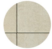
Industria, Smooth Beige Cream