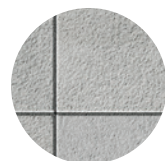
Industria, HD² Granitex Greyed Nickel