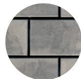
Hydra Shale Grey

Montreal’s climate also posed challenges to the designer: The region’s heavy rainfall and winter weather can wreak havoc on paving options over time. The designers for the project needed an exterior design solution that could incorporate durability and effective stormwater management, without sacrificing any of the “distinctive” style developers were after.