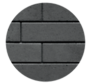
Linea Onyx Black