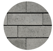
Linea Greyed Nickel